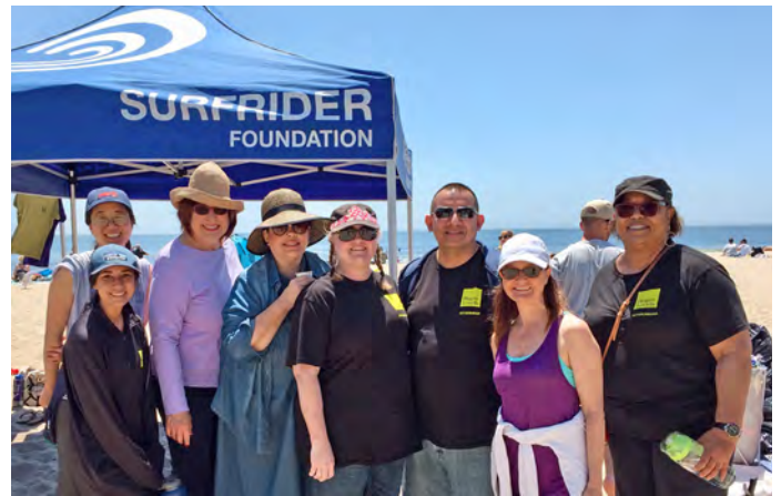
Hogan Lovells LA Surfrider Foundation beach clean-up

Hogan Lovells took an extra step to engage employees in a hands-on way this past April for Earth Month. The firm conducted an awareness campaign to emphasize the role that business, government, and civil society must play in ensuring responsible stewardship of Earth's resources. The campaign identified environmental challenges facing the global community by sharing facts and targets surrounding relevant United Nations Sustainable Development Goals, and suggested ideas for how their workforce could contribute to progress. With a call to action, offices were asked to undertake at least one change or initiative during the month, resulting in numerous clean-up teams who helped to eliminate trash from local waterways and contribute to sustainable development initiatives, as well as new techniques for fostering a green culture.