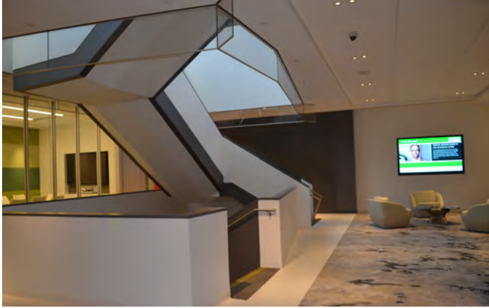
Nixon Peabody LA Staircase