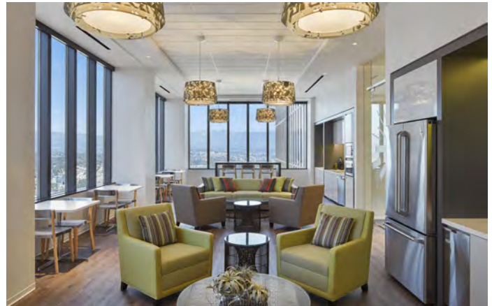
Nixon Peabody LA Cafe and seating

Many law firms first choose to tackle energy initiatives because of the direct impact on energy and cost savings and opportunity for innovation. At Cahill, lights in individual offices were switched to motion sensors and timers and energy intensive computer servers were reduced by 50%. Beveridge & Diamond instituted a “lights-off” policy, which helped contribute to a 10% reduction in electricity usage in its sub-metered New York office. Ward and Smith installed programmable thermostats and received an 8% energy savings. Requiring some investment, Beveridge & Diamond participates in the Green Power Partnership, purchasing Renewable Energy Credits to cover 100% of its nationwide energy usage from renewable sources. Nixon Peabody took a more holistic approach to energy efficiency, by turning to the EDF Climate Corp program where it once hired a fellow to develop an energy management roadmap. In its commitment to reduce energy usage, Fried Frank’s New York Office has joined the NYC Carbon.