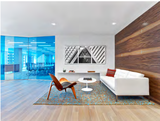
Nixon Peabody DC Lobby Seating

Building design is undoubtedly one of the most long-lasting, effective, and impactful ways to incorporate sustainability (and wellness) as it gives the opportunity to incorporate innovative design, energy-efficient technology, and sustainable materials. Nixon Peabody made a conscious decision to pursue LEED certification for major construction projects in its spaces. Its LEED Silver Los Angeles office boasts a large rooftop deck, while its LEED Gold New York office uses reclaimed wood from the Hudson River area mills dating back to the Industrial Revolution. The firm's LEED Platinum DC office features a three-story living wall, which is watered using condensate from the HVAC system.