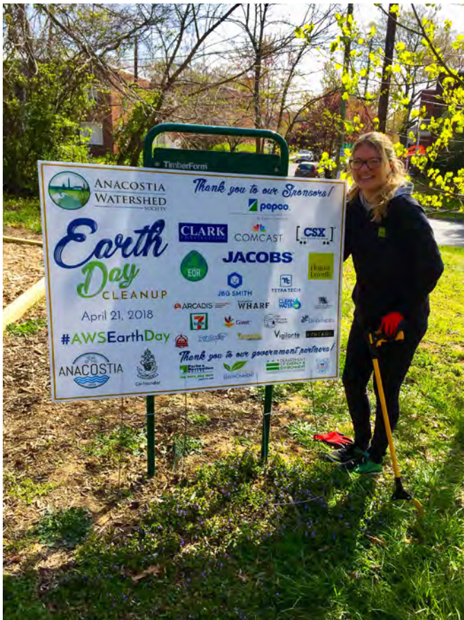
Hogan Lovells DC Anacostia Watershed Society Earth Day Cleanup

Eisenberg, Hunton Andrews Kurth, and Cahill have eliminated plastic straws. Cahill installed filtered water dispensers in pantries on all floors and all employees were provided with reusable water bottles. Ater Wynne uses filtered water and glassware and installed a soda maker to eliminate plastic bottles.