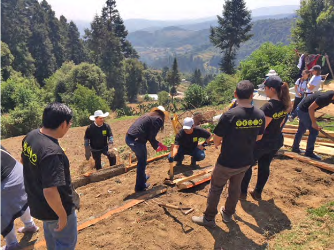
Hogan Lovells Mexico organic vegetable garden build

Activities like contests, particularly ones that include donations as part of the prize or end game are also part of showing employees the firm's sustainability values. Beveridge & Diamond holds a yearly photography contest during Earth Month with different themes. Winners have their artwork displayed, creating a sense of pride and community. The firm has also held an auction where employees created something from recycled materials and the funds went to a charity.